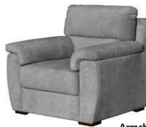
Armchair 102 x 90 x 92 cm