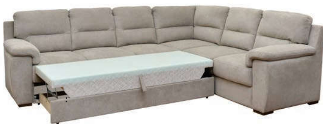
Sleeping area 123 x 235 cm